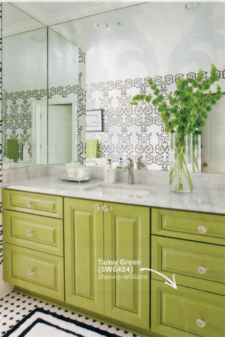
Tansy Green (SW6424) Sherwin-Williams

Just ask Jeanne Sellers—going on 90, but still living strong in her Atlanta townhome—who keeps redoing rooms with colors that are anything but dull. “I like creative rooms,” Jeanne says. “And I’ve always been drawn to black and white with a bright color mixed in.”